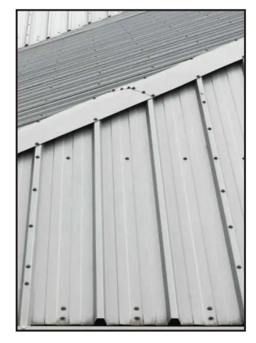
ROOF REPLACEMENT CAMPAIGN

Please call 772.770.4424 for more information. Donate online at womensrefugevb.org or mail your check to Women's Refuge, P.O. Box 1484. Vero Beach, FL 32961 and mention roof campaign.