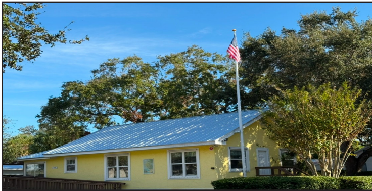
Pictured: Women's Refuge of Vero Beach We extend thanks to the anonymous donor of our new flag.